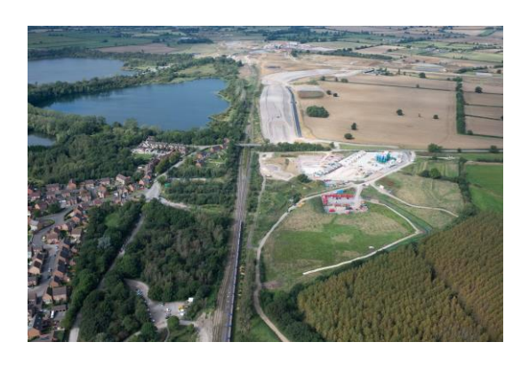
School Hill Compound and Calvert Green, September 2021.

We need to create a crossing point at School Hill Compound to allow our vehicles to access our internal construction road network from one side of Werner Terrace to the other, removing a significant number of HS2 construction vehicles from the local road network and reducing our impact on the local community.