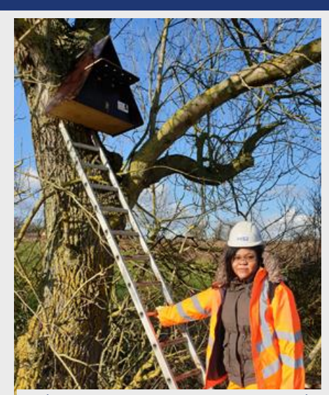
To date, 135 temporary nesting sites, such as the one shown in the image above, have been installed.

To avoid the risk of potential disturbance to breeding barn owls during construction, HS2 are installing temporary nest sites outside the area of risk and closing off potential nest sites where disturbance to barn owls may occur. Before the line becomes operational and to maintain the breeding population, HS2 are creating up to 240 new artificial nest sites at least 3km from the railway.