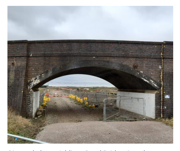
Pictured above, Addison Road Bridge, Steeple Claydon, February 2022.

We understand the impact Addison Road bridge's closure has brought to the local community, and we are doing everything in our power to ensure these works are completed on time to allow the public to use this road again safely.